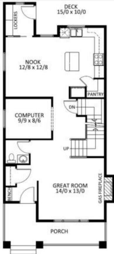
MAIN FLOOR PLAN 933 SQ.FT.